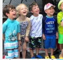
Fun in the Sun