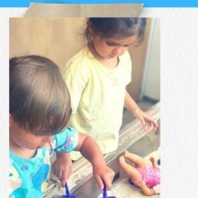
Beach at Gan