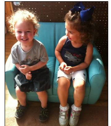
Klub 4 Kidz