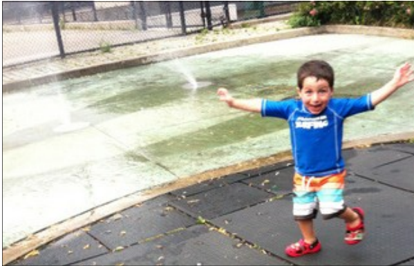
Water Fun & Outdoor Playground