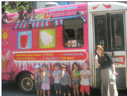
A visit from the Kosher Ice Cream Truck!