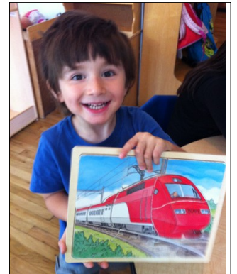
Discovery Play in the Classroom